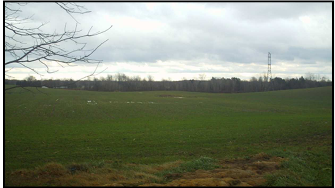
Photo of the Bradford Trust farm in 2011.