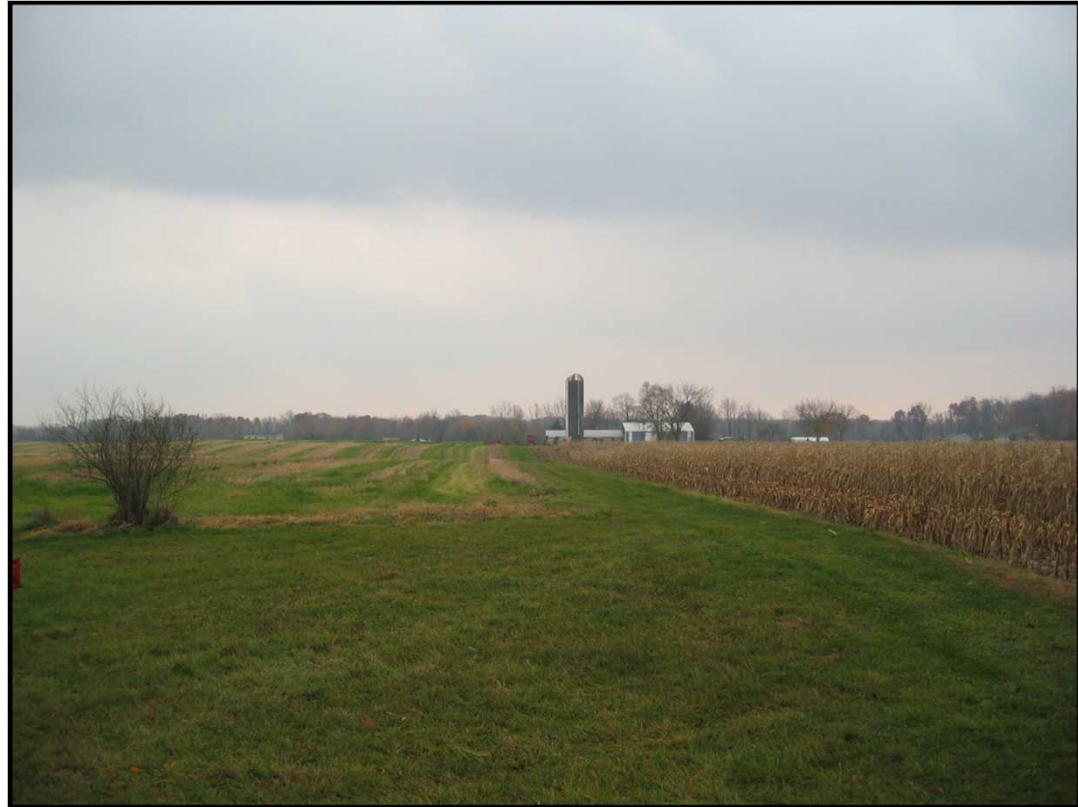
Photo of the Flanagan farm by Kendra Wills of MSU Extension in 2005.