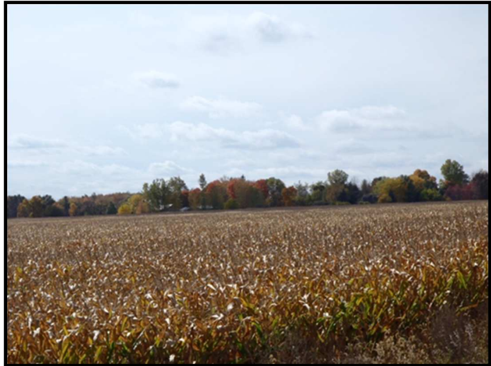
Photo of the Patterson farm in 2012.