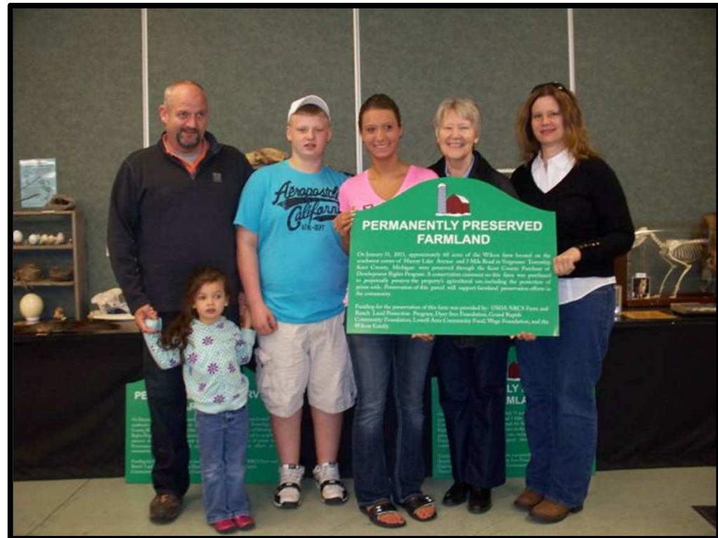
Photo of the Wilcox family in 2011.