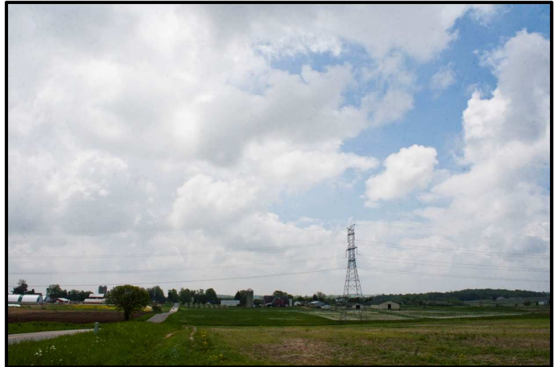
Photo of Bettes and Kingsbury Farm by Aquinas College Photographer in 2011.