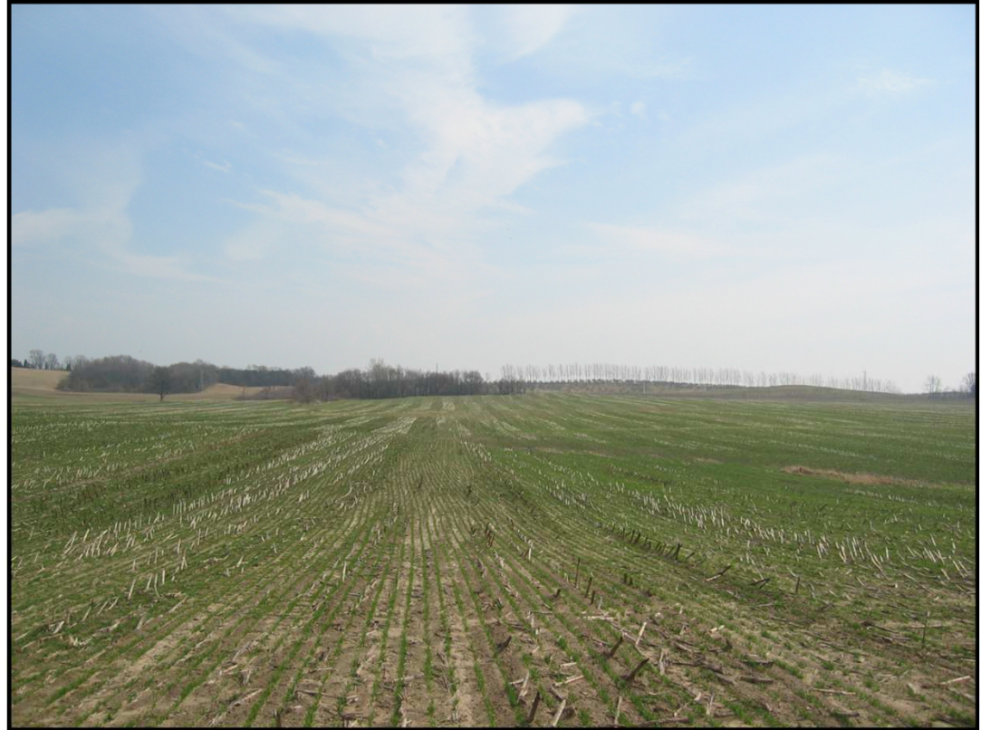
Photo of the Bradford farm by Kendra Wills of MSU Extension in 2007.