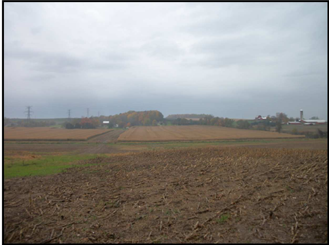
Photo of Bradford LLC Farm by Kendra Wills of MSU Extension in 2011.