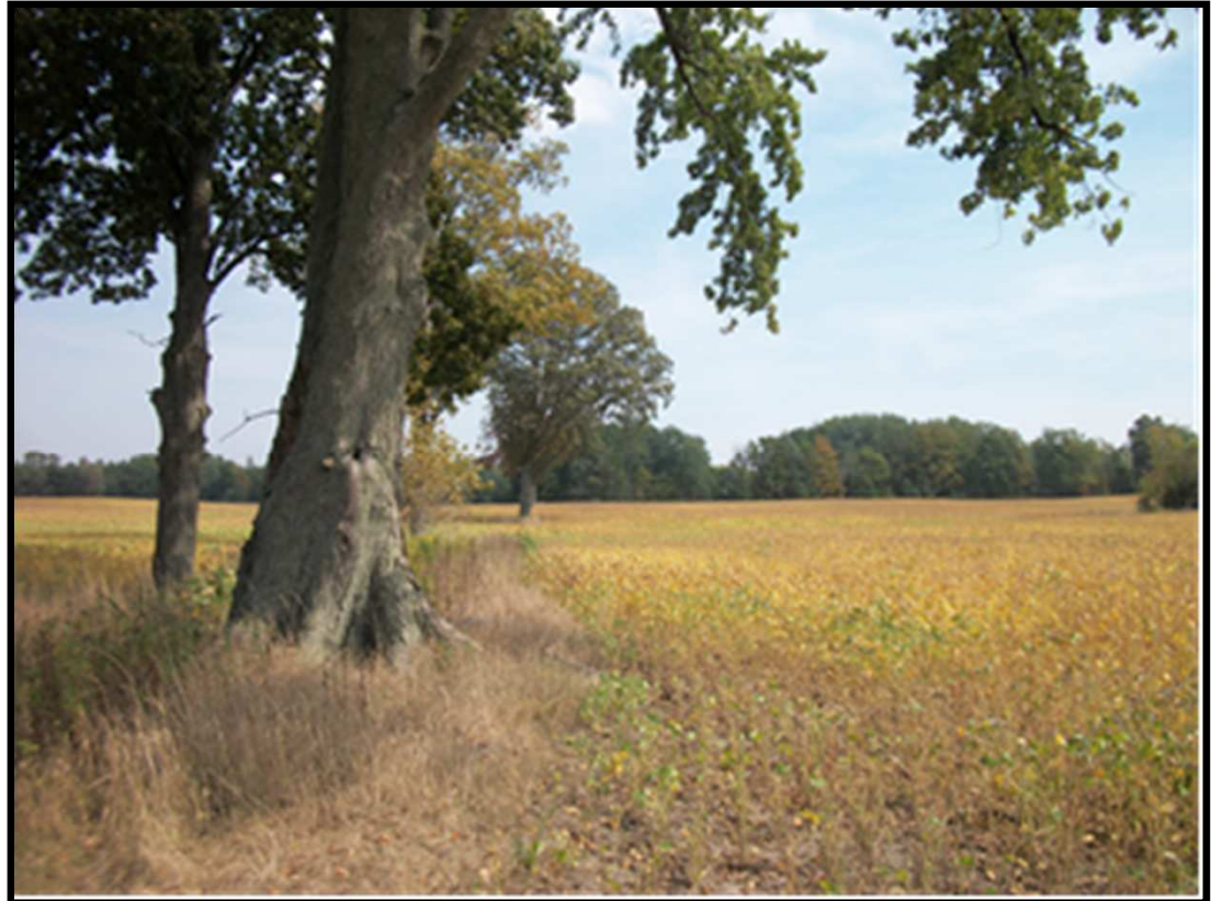
Photo of the Nauta Farm in 2010.