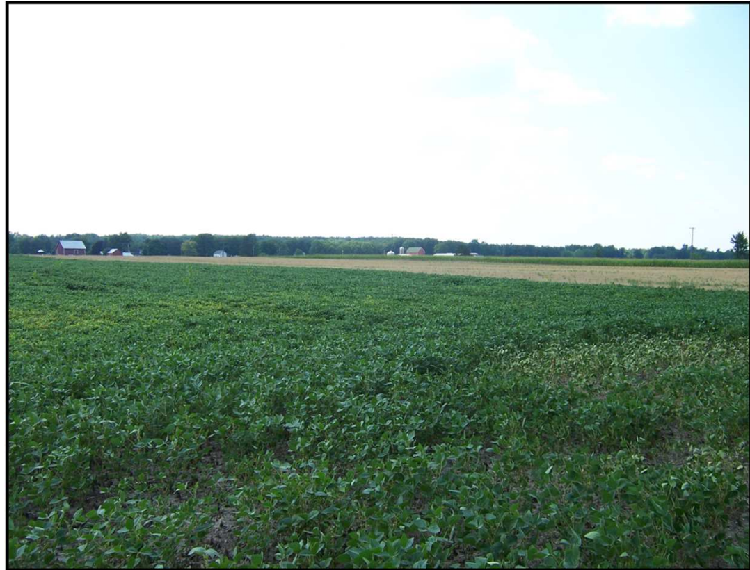
Photo of the Merriman farm by Kendra Wills of MSU Extension in 2009.