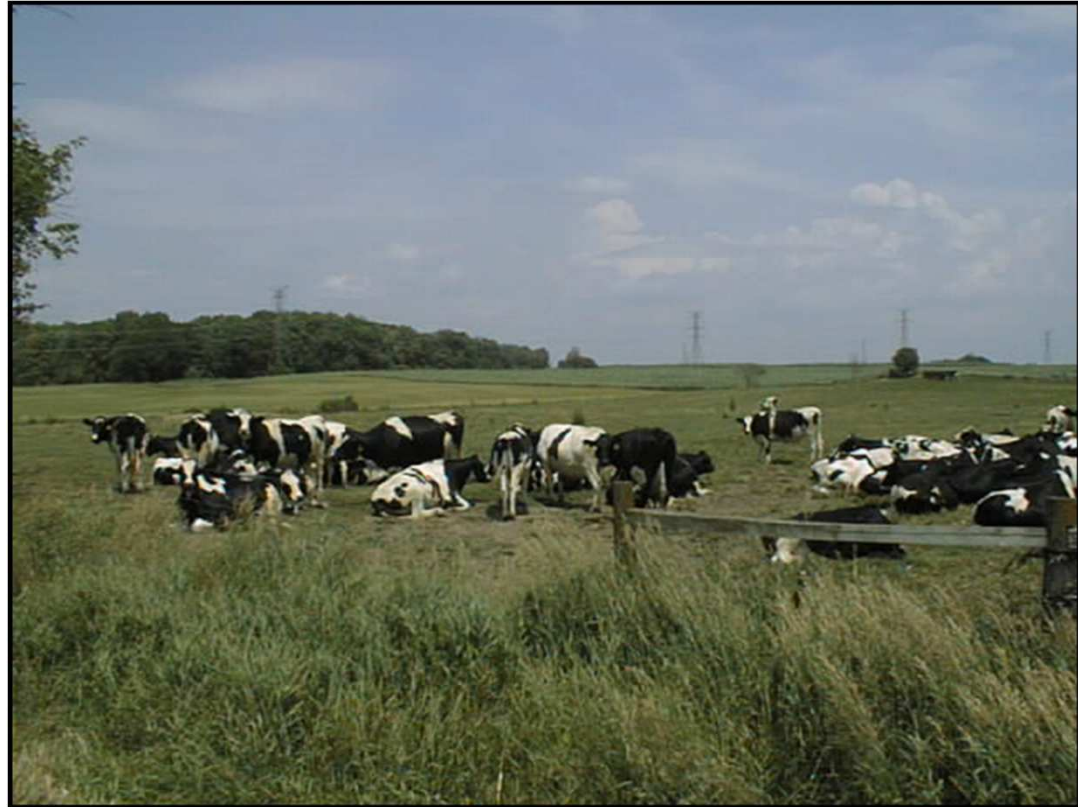
Photo of the Robinson farm by Kendra Wills of MSU Extension in 2007.