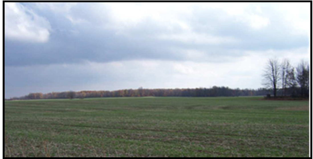
Photo of the Rittersdorf farm in 2010.