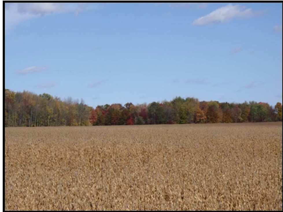
Photo of the Lovins farm taken by Kendra Wills of MSU Extension in 2012.