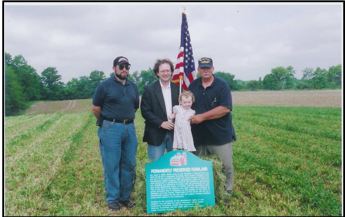
Photo of the Howard family taken by Kendra Wills of MSU Extension at the closing ceremony in 2005.

*Note: All Development Rights Costs were determined by an independent, state certified appraiser hired by Kent County. This is true for all 21 farms preserved by the Kent County PDR Program.