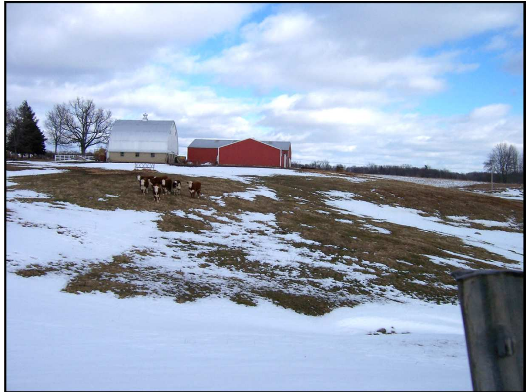
Photo of the Seif farm.