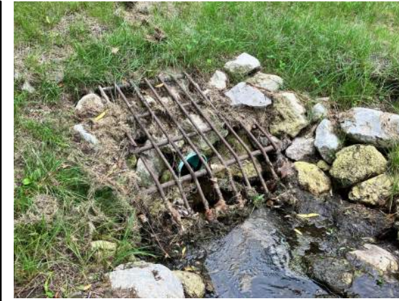
Inlet of new 8-inch PVC outlet, with trash rack