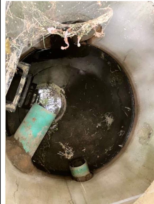
Discharge into MH #2