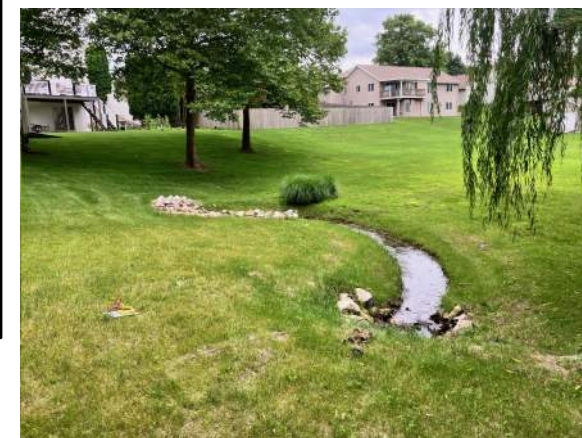
Low flow channel connecting FES #1 to new outlet